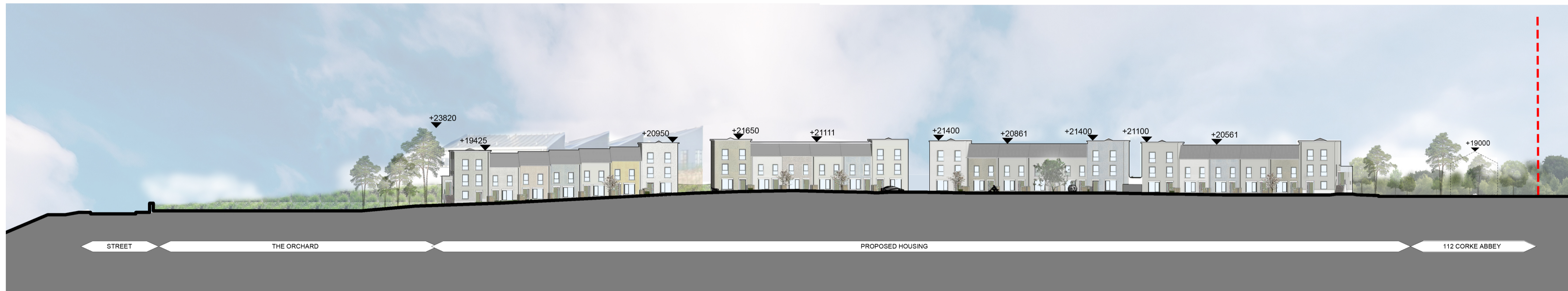
Site-Wide Elevation 07 1 : 500