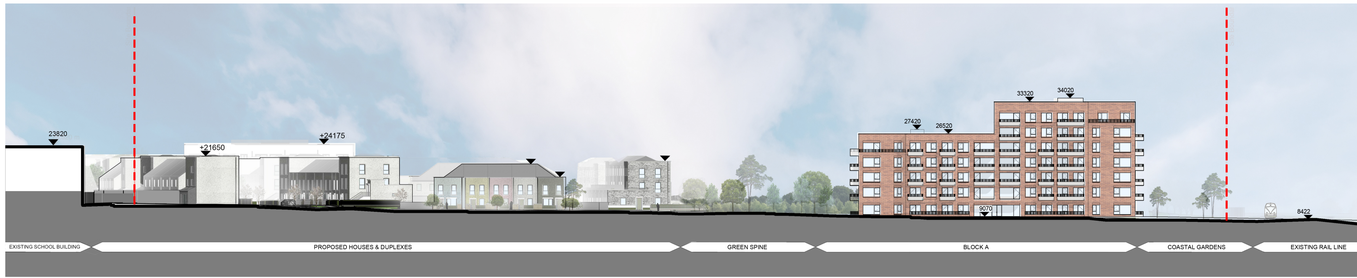
Site-Wide Elevation 05 1 : 500