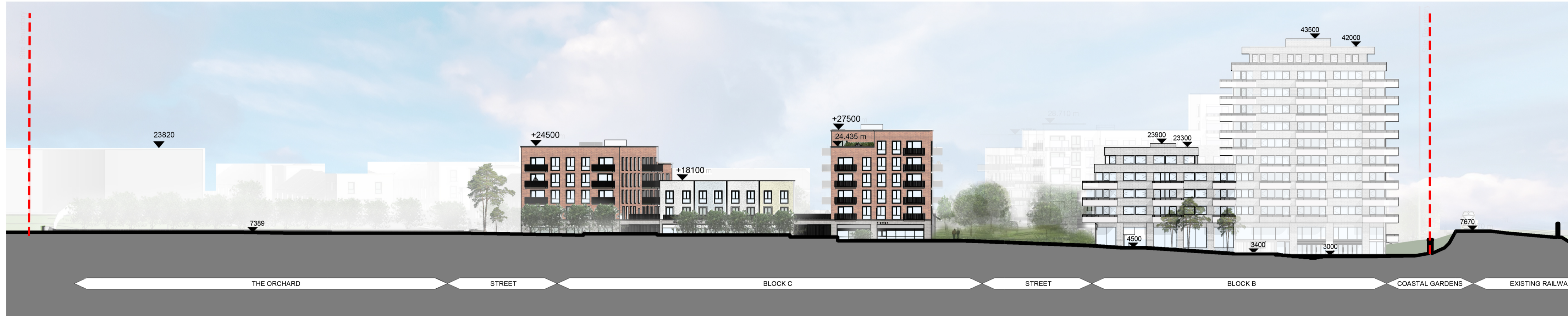
Site-Wide Elevation 06 1 : 500