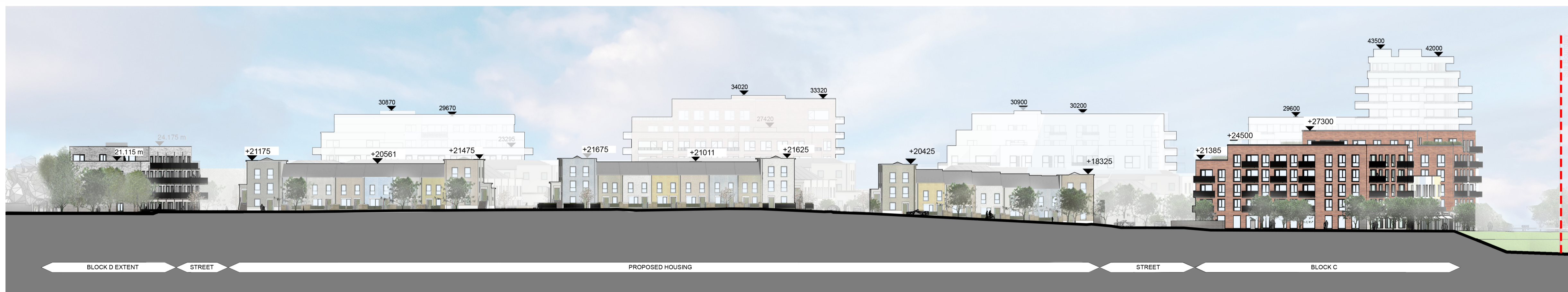
Site-Wide Elevation 08 1 : 500